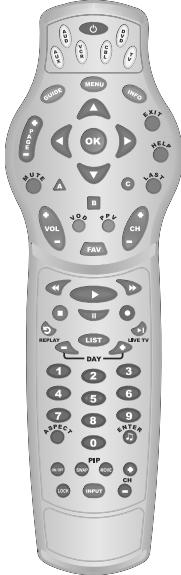
© 2004 ICX Global, Inc. All rights reserved. Part Number ICX18347, version 1.0 07012004

VISIT US ON THE WEB YOU CAN FIND PROGRAMMING INSTRUCTIONS AND CODES FOR ALL OF OUR REMOTE CONTROLS, AS WELL AS INFORMATION ABOUT OUR OTHER PRODUCTS ON OUR WEBSITE: www.icxglobal.com